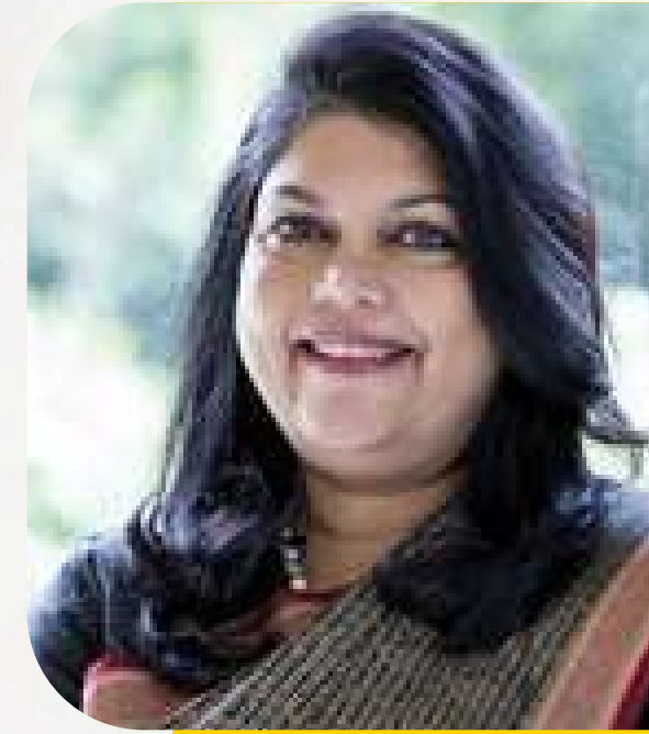
Ms. S. Falguni Nayar Founder & CEO Nykaa.com