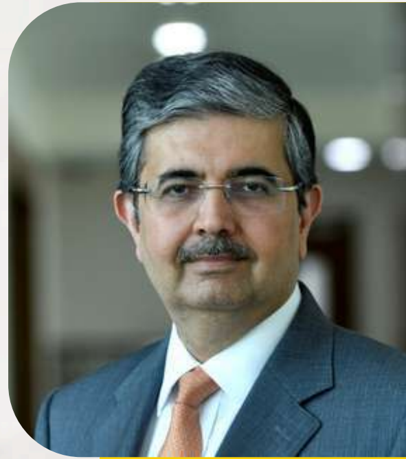
CHAIRPERSON Shri Uday Kotak Founder and Director, Kotak Mahindra Bank Ltd.