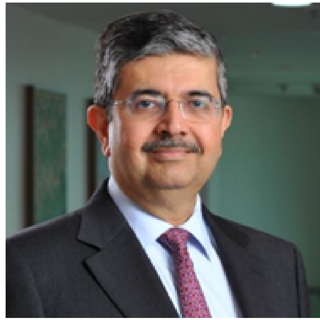
Shri Uday Kotak Chairperson, BoG MD & CEO, Kotak Mahindra Bank Ltd.