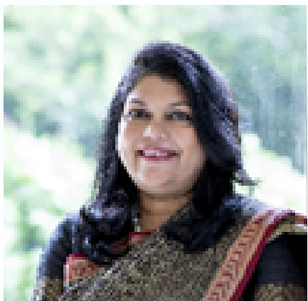
Ms. Falguni Nayar Founder & CEO Nykaa