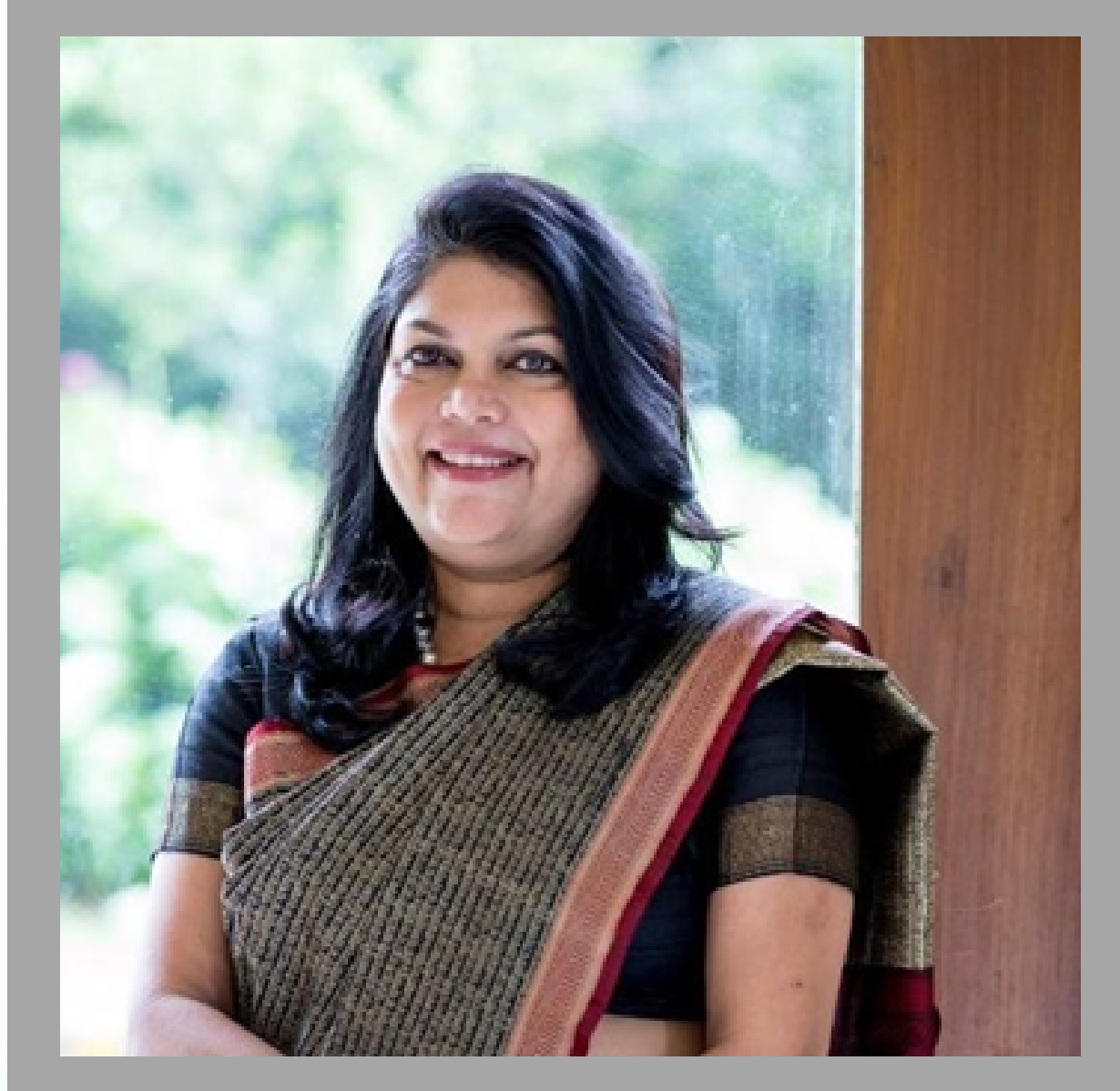
Ms. Falguni Nayar Founder & CEO, Nykaa Guest

Falguni Nayar founded Nykaa in 2012 with the vision of building a multi-brand omnichannel beauty focused retail business. Within a span of 10 years, Falguni has built India's leading beauty and lifestyle focused consumer technology platforms. Providing a comprehensive e-commerce experience, Nykaa offers over 4.3 million product SKUs from over 4,000 brands. Under Falguni's leadership, Nykaa has emerged as India's leading beauty retailer, playing a critical role in developing the Indian beauty market and further being recognized on Time's 100 Most Influential Companies list. Over the last decade, following Falguni's vision, Nykaa has expanded its product categories by introducing online platforms Nykaa Fashion, Nykaa Man and SuperStore (B2B business).