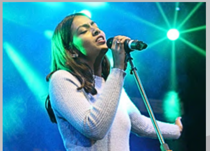
Scenes from Ridham"23