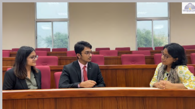
Snippets from 'Faculty interaction Series'