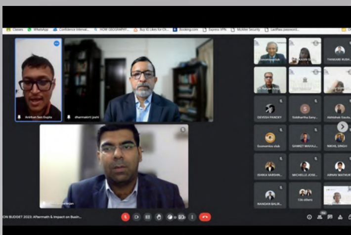
Glimpses from the Tank-Vitark Competition