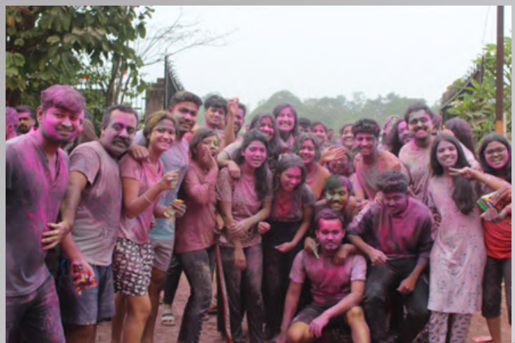
Glimpses from the Holi Celebrations