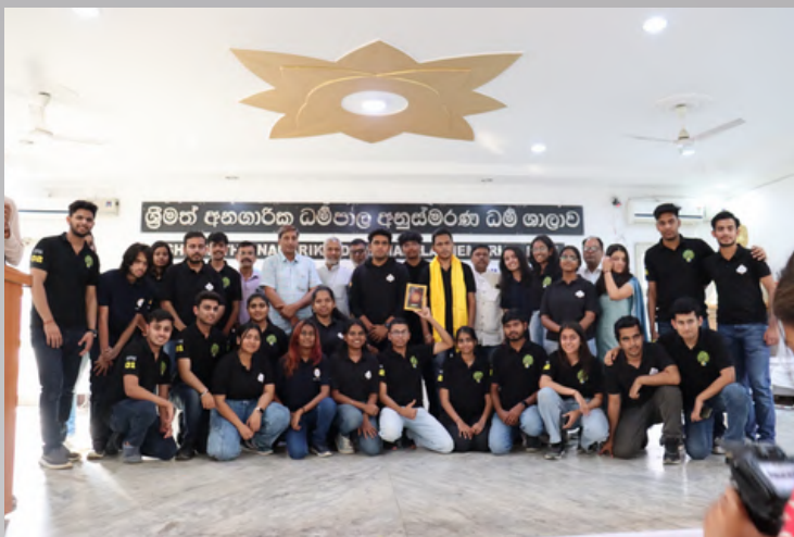
Scenes from the Nukkad Natak