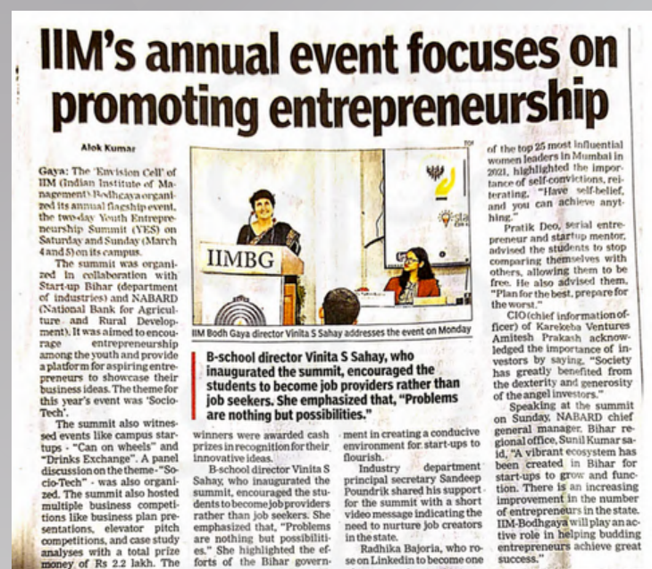
Stills from the media presence of YES'23