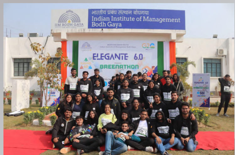
Glimpses from the Greenathon