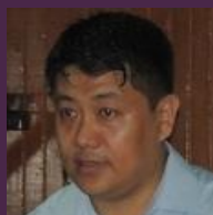
Shri Asangba Chuba Ao Secretary, Department of Education Government of Bihar