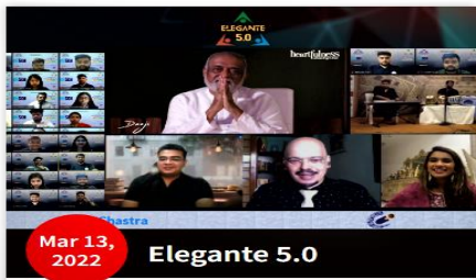
Mar 13, 2022 Elegante 5.0

Indian Institute of Management, Bodh Gaya organized its flagship fest "Elegante 5.0" starting from 11th March to 13th March of 2022. Elegante is a dedicated effort of all the clubs and committees of the institute. Students come together to organize and participate in many entertaining and educational competitions. This year's event was sponsored by [...]