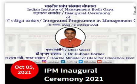
Oct 05, 2021 IPM Inaugural Ceremony 2021

On the occasion of World Mental Health Day, IIM Bodh Gaya organized a Wellbeing Conclave 2021. The objective of celebrating World Mental Health Day is to raise awareness of mental health issues worldwide and mobilize efforts to support mental health. IIM Bodh Gaya has always been at the forefront of the discussion around mindfulness. Taking [...]