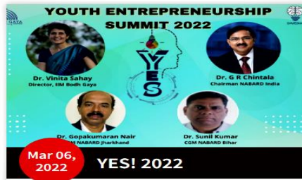
Mar 06, 2022 YES! 2022

Indian Institute of Management, Bodh Gaya organized its flagship fest "Elegante 5.0" starting from 11th March to 13th March of 2022. Elegante is a dedicated effort of all the clubs and committees of the institute. Students come together to organize and participate in many entertaining and educational competitions. This year's event was sponsored by [...]