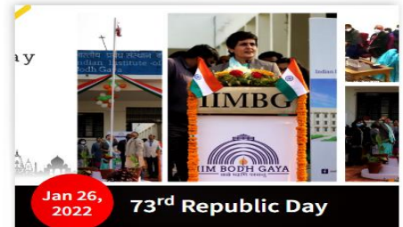
Jan 26, 2022 73rd Republic Day

Envision, the Centre for Entrepreneurship and Industrial Relations, IIM Bodh Gaya organised the third edition of its flagship event – Youth Entrepreneurship Summit (YES) 2022- A sustainable way, on 5th and 6th March 2022. This venture sought to provide a platform for early-age startups and young entrepreneurs to enrich and prove their mettle even in [...]