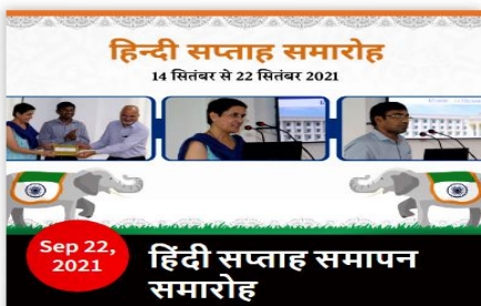
Sep 22, 2021 हिंदी सप्ताह समापन समारोह

In the journey of imparting quality education in the field of management, IIM Bodh Gaya has introduced a five-year Integrated Programme in Management (IPM) for the Class XII pass outs. It has always valued and promoted diversity and inclusion in every aspect, and hence the IPM programme offered is open to students from varied domains, [...]