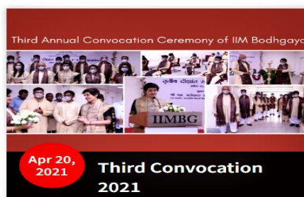
Apr 20, 2021 Third Convocation 2021

International Yoga Day is celebrated on 21st June 2021, and this year's theme was 'Yoga For Wellness'. The prime focus is on practicing yoga for physical and mental well-being. The motto is aligned well with the current world scenario. IIM Bodh Gaya celebrated this day with much fervor and conducted a virtual yoga session. Vinita [...]