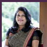
Ms. Falguni Nayar Founder & CEO Nykaa.com