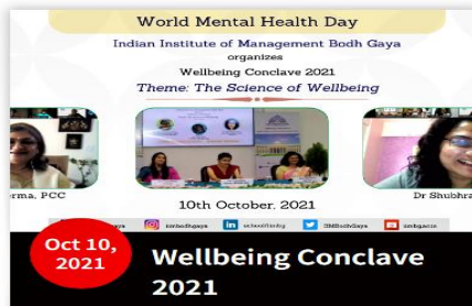
Oct 10, 2021 Wellbeing Conclave 2021

Constitution Day, also known as "National Law Day" or "Samvidhan Divas", is celebrated on 26 November every year to commemorate the adoption of the Constitution of India. On 26 November 1949, the Constituent Assembly of India adopted the Constitution of India and hence the day was chosen to spread the ideologies of the constitution [...]