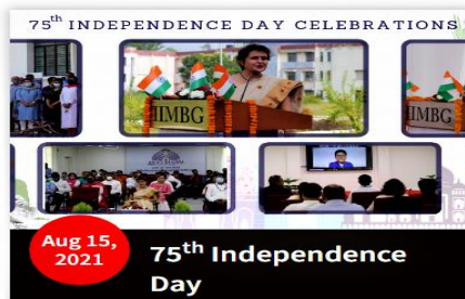
Aug 15, 2021 75th Independence Day