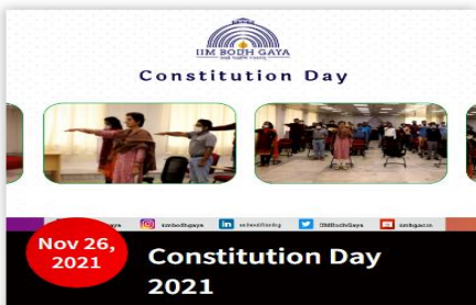
Nov 26, 2021 Constitution Day 2021

To celebrate the glorious occasion of the 73rd Republic Day, IIM Bodh Gaya organized a special event in online-cum-offline mode. The entire institute fraternity came together to celebrate the day on which our constitution was laid out. A cultural event was also organized as a part of the celebration by the Cultural Committee, IIM Bodh [...]