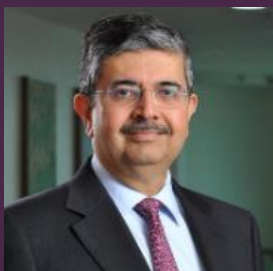
Shri Uday Kotak Chairman, BoG

Indian Institute of Management Bodh Gaya Managing Director & Chief Executive Officer, Kotak Mahindra Bank Ltd.