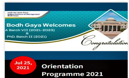
Jul 25, 2021 Orientation Programme 2021

On the occasion of 75th Independence Day, the entire fraternity of IIM Bodh Gaya came together to commemorate the auspicious day. The event was organized by the Cultural Committee and Unnayan Club in collaboration with MBA07. The event was a beautiful ode to the long battle fought by our freedom fighters for the love of [...]