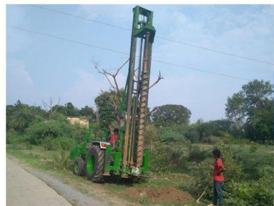
Construction of Permanent Campus begins

Delegates from IIM Bodh Gaya participated in the distinguished Digital Event #FUTURE, conducted in the state of Kerala. The two-day event saw the convergence of achievers, professionals, entrepreneurs, academicians and other stakeholders in the knowledge industry from across the globe. There were discussions related to emerging trends, ground realities and opportunities that would help individuals and enterprises to compete and lead in a digital world.